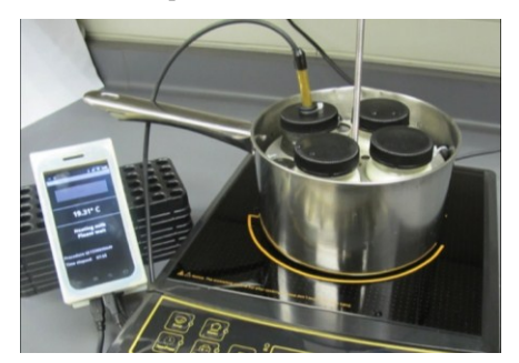
Figure 3: ODK Sensors deployment at a human milk bank in Durban. The application guides users through the pasteurization process by providing feedback based on temperature of breast milk (contained in jars that are heated).

Milk banks in South Africa are using ODK Sensors to monitor breast milk pasteurization. Milk banks pasteurize breast milk from donor mothers to deactivate pathogens (e.g., HIV, Hepatitis) before feeding vulnerable infants. We built a monitoring application (Figure 4) that connects a temperature sensor and a Bluetooth printer to an Android phone. The top-level user application utilizes the sensed milk temperature to guide users through the pasteurization process, and a successful completion prints a pasteurization report as well as labels for the milk bottles.