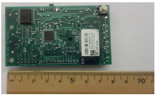
Figure 2: FoneAstra, a reconfigurable interfacing board to enable wired or wireless communications between mobile devices and low-level sensors connected to the board.

Motivating use cases and different types of mobile sensing applications for ODK Sensors were presented in [4]. To enable a wider variety of sensing applications we developed a custom interfacing board called FoneAstra (Figure 2) that connects to mobile devices over wired (UART) or wireless (Bluetooth) communication channels as well as sensors that only have lowlevel, analog or digital (e.g., I2C, SPI) communication interfaces. Being battery-powered, FoneAstra can operate autonomously enabling it to support applications like WaterTime [3], where a mobile device connects intermittently to a sensor board to retrieve sensed data buffered over a period of time. For applications like milk banking [5] and vaccine monitoring [2], in which a mobile phone is co-located with the board, FoneAstra has a 2nd micro-USB port that is used to power the co-located phone. When connected to a mobile device capable of being a USB Host the board can be powered by the mobile device itself and does not require a battery. Additionally, FoneAstra has an on-board SD memory socket, a real-time clock (for autonomous data collection), a few LEDs, and an audio buzzer for feedback to users