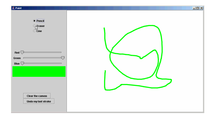
Figure 1. The Paint program that participants enhanced.

result in programming errors [1, 17]. Because interruptions increase the likelihood of such failures, we may be able to develop tools that use models of interruptibility to help reduce programming errors, perhaps by preventing interruptions or by noticing when programmers are interrupted at particularly non-interruptible points in their work and then helping them recover. Programmers also seem to be a good example of knowledge workers whose work involves significant interaction with computers, and so we are hopeful that results obtained with programmers will transfer to other computer-centric knowledge work. While results seem less likely to transfer to office workers who use computers relatively little, we are comfortable with this tradeoff because it seems like the advances offered by sensor-based statistical models of human interruptibility will initially be most relevant to computer-centric workers.