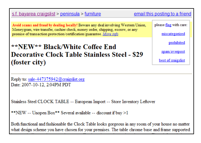
Figure 1. Semi-structured online classified posting

We proposed to extract relational schemas rather than semi-structured (e.g., XML) schemas because relational schemas are the most widely used technique for describing structured data [2], and there are many good existing tools for querying and use of relational schemas.