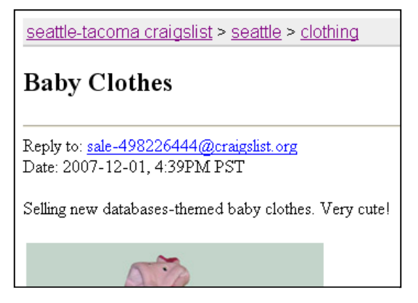
Figure 3. Example craigslist posting

To illustrate what each component of the architecture does, we will trace through a very short, one sentence document as an example. We will show how the document is transformed by each tool in sequence, and discuss the goal of each tool and the reason for using it.