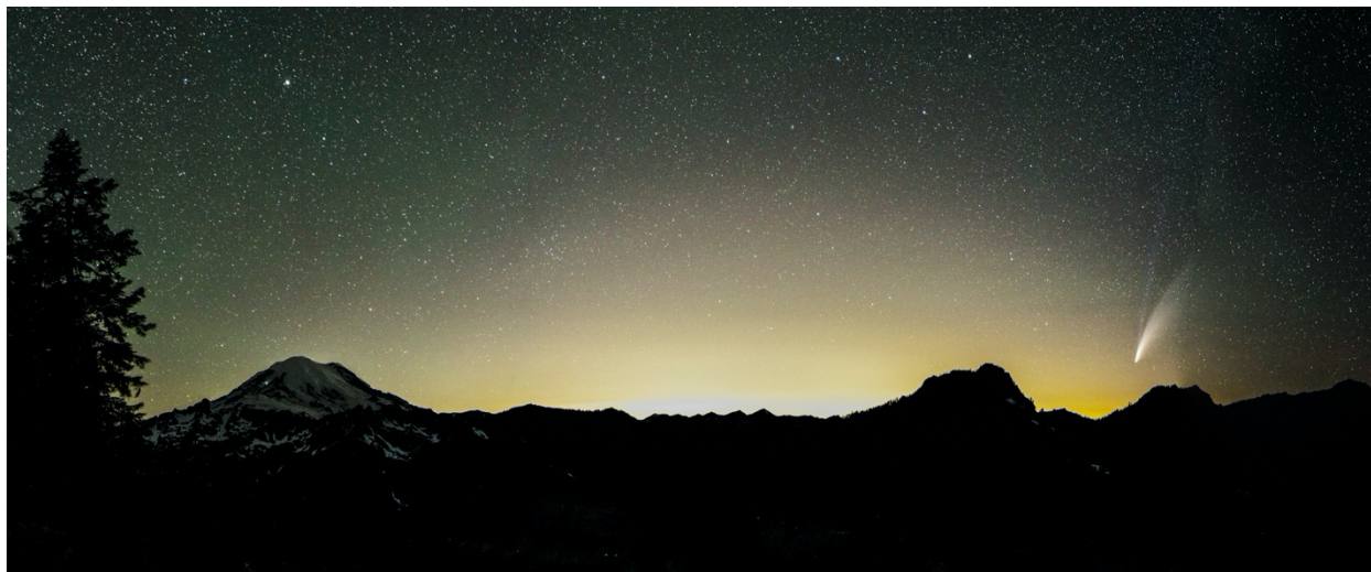
July 15, 2020: Comet NEOWISE setting north of Mt Rainier (note climbers' headlamps below the summit)