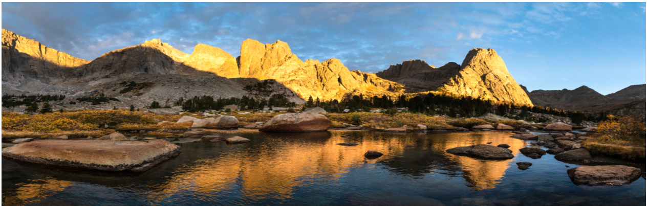
View from our September campsite in Wyoming's Wind River Mountains