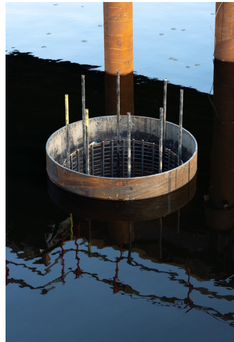
Giant porthole into the water— part of the 520 bridge construction

recovered, though, and delights in chasing our cat, Sahara, when the feline foolishly ventures into Ellie's domain on the first floor of our house. Now almost ten years old, Ellie is slowing down a bit, but she still joined us on a few hikes and backpacks as shown in the picture.