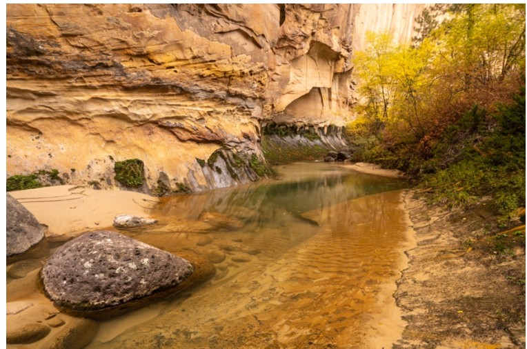
Death Hollow, Utah