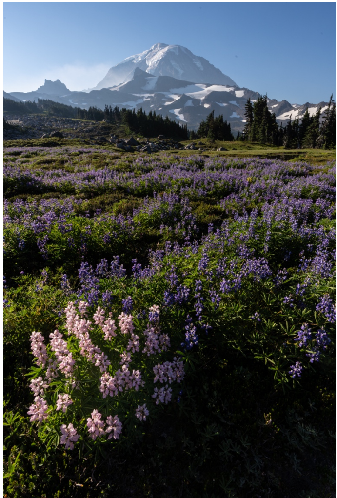
Alpine Lupine in Spray Park, Mt. Rainier National Park