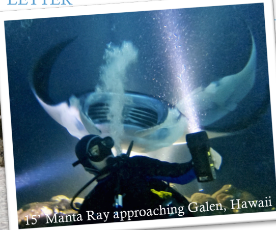
15' Manta Ray approaching Galen, Hawaii