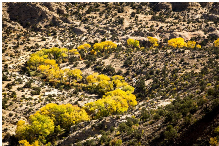
Autumn foliage in Boulder Creek, Utah