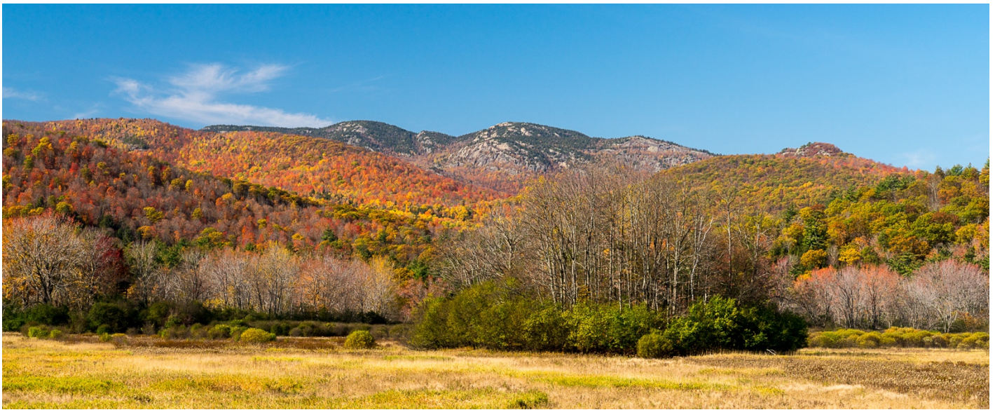
^ Fall foliage in the Adirondack Mts.