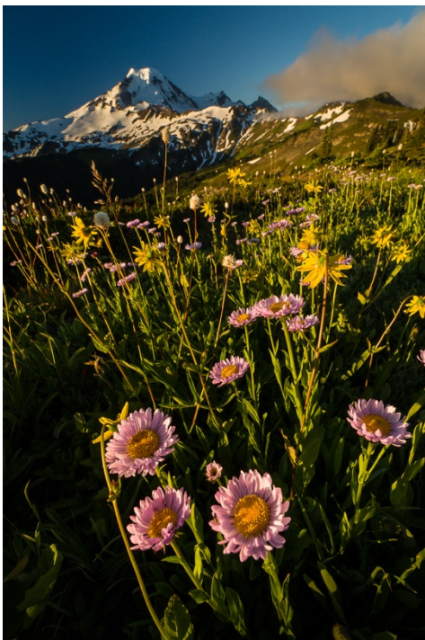
< Summer flowers near Mt. Baker