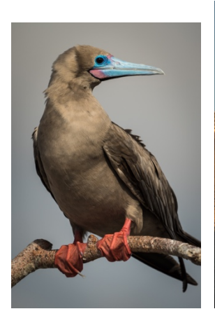
Red-footed Booby, Galapagos