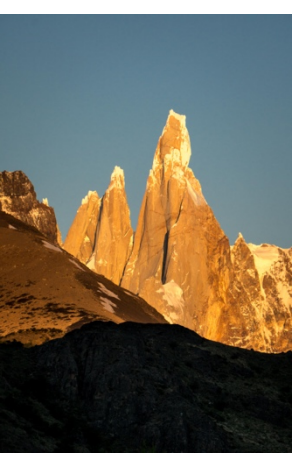
Cerro Torre at dawn