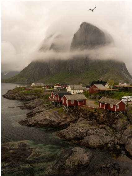
Hamnoy village, Lofoten, Norway