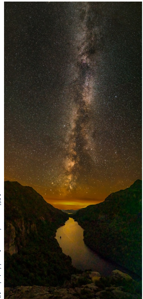
Milkyway above Ausable Lake, NY

We wish you a healthy, fulfilling 2020. We hope that our country can come to its senses and make the next decade a time of positive trends.