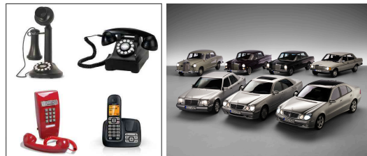
Figure 1. Design variation over time of the telephone (left) and the Mercedes E Class (right).

Google Image Search API; the search term consisted of the manufacturer, the model and the line (e.g. Mercedes S Class W116). The line term corresponds to a particular production year and we manually created the correspondences from lines to years in the range 1972-2013. The downloaded images were then manually cleaned by removing all the samples depicting the interior of the cars and other noisy data. The process resulted in approximately 30 images per car line and 1088 images in total. The obtained hierarchy is shown in Figure 2.