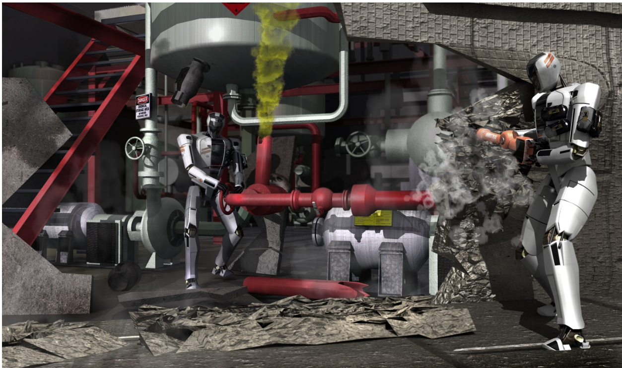
Figure 1. Illustration of example disaster response scenario.

Figure 1 illustrates Event 6 (the robot on the right-hand side using a power tool) and Event 7 (the robot on the left-hand side turning a valve). The form of these robots is for illustration only; while the robot must be compatible with human operators, environments and tools, there is not a requirement that it have a humanoid form.