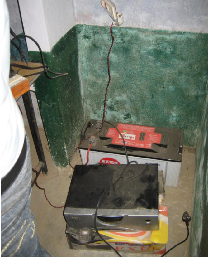
Figure 4. Image showing the problematic electrical setup at West Village

the cause, we soon realized that there was only one power outlet that was being used by our equipment (see Figure 4).