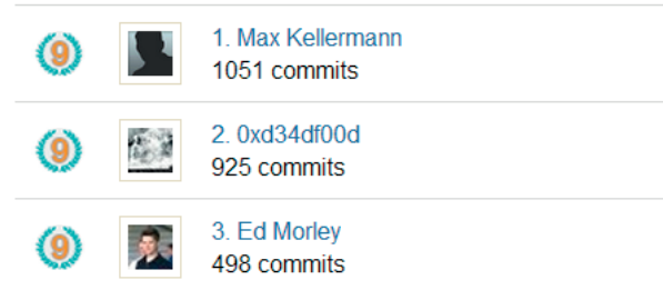
Figure 2. Current programming language analytics on ohloh.net.

Accounts with the most commits in C++ between Sep 2013 and Nov 2013 as measured by Ohloh.