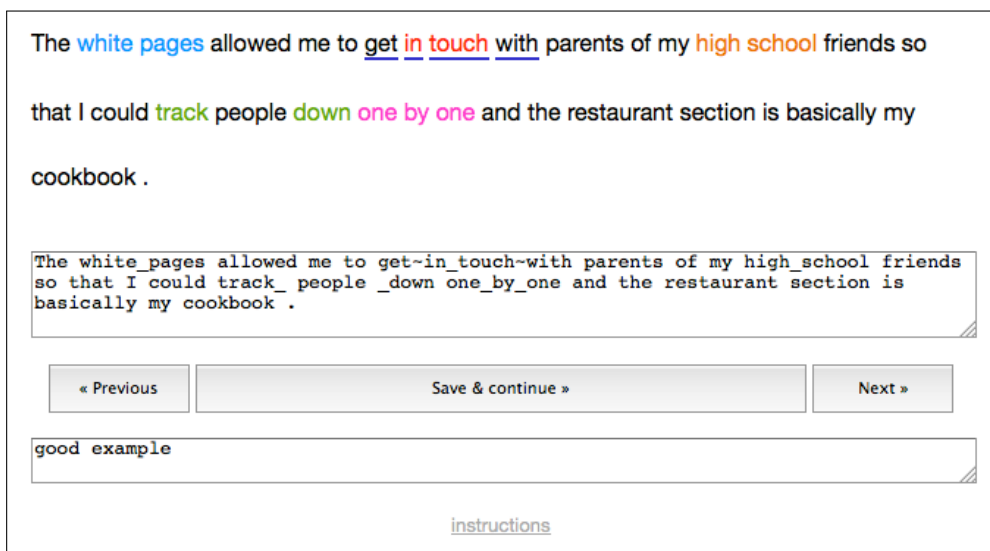
Figure 3: MWE annotation interface. The user joins together tokens in the textbox, and the groupings are reflected in the color-coded sentence above. (Invalid markup results in an error message.) A second textbox is for saving an optional note about the sentence. The web application also provides capabilities to see other annotations for the current sentence and to browse the list of sentences in the corpus (not shown).

tic manipulations and substitution of synonyms/antonyms, along with informal web searches, were often used to investigate the fixedness of candidate MWEs; a more systematic use of corpus statistics (along the lines of Wulff, 2008) might be adopted in the future to make the decision more rigorous. Annotation guidelines. Annotation conventions were recorded on an ongoing basis as the annotation progressed. The guidelines document describes general issues and considerations (e.g., inflectional morphology; the spans of named entities; date/time/address/value expressions; overlapping expressions), then briefly discusses about 40 categories of constructions such as comparatives ( as X as Y ), age descriptions ( N years old ), complex prepositions ( out of , in front of ), discourse connectives ( to start off with ), and support verb constructions ( make a decision , perform surgery ).