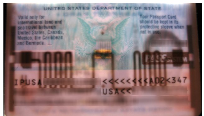
Figure 3: The antenna inside a Passport Card. Certain personally-identifiable information has been obscured.

The experiment we conducted was done in a very noisy environment, consisted of multiple readers interfering with each other giving very inconsistent readings (Figure 1). Setup was fairly simple. We had a single tag that was being probed in clear line of sight. Our first goal was to determine if there was any meaning that could be extracted from these erratic readings. Given the setup above, we took n number of readings and recorded those values. Afterward we kept on shifting the tag few centimeters at a time and recording those values as well. The results were as following. Taking the average of values for each of the measurements revealed interesting results. We were able to effectively determine relative distance based on the averaged RSSI readings.