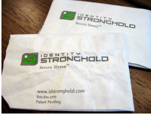
Figure 1: The sleeves used for our shielded distance tests. The crumpled sleeve is in the foreground, with the new sleeve behind it.

able operational range of tens of feet [39], read ranges can vary considerably as a function of the material to which a tag is affixed, the configuration of the interrogating reader, and the physical characteristics of the ambient scanning environment.